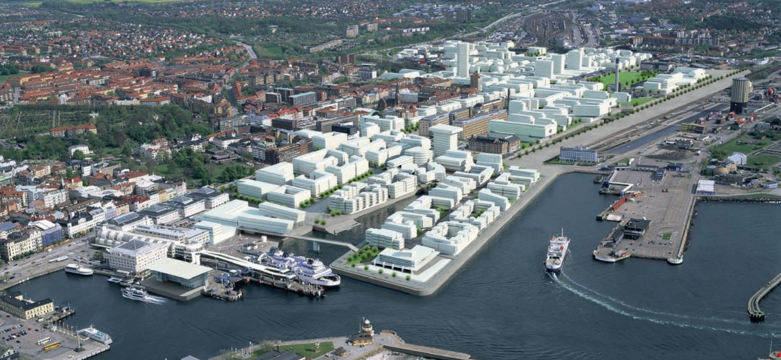
Model picture Southern Harbour in Helsingborg year 2030. Photo: Bertil Hagberg. Montage: Cadwalk AB.